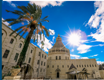
Church of the Annunciation