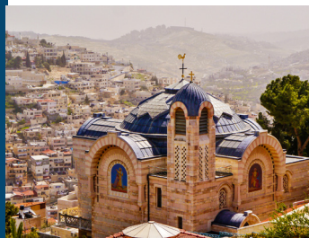
St. Peter in Gallicantu