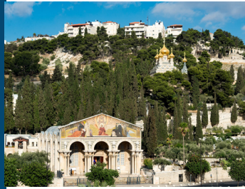
Mt. Of Olives