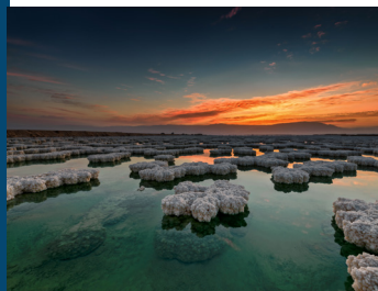
The Dead Sea